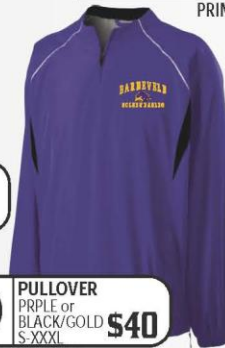
PULLOVER PRPLE or BLACK/GOLD S-XXXL $40 EMBROIDERED