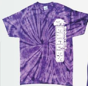
TIE DYE SHIRT PURPLE ADULT S-XXL YOUTH M-L $15 PRINTED