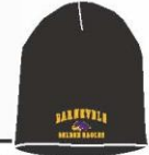
BEANIE BLACK EMBROIDERED $12