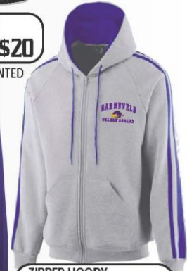
ZIPPER HOODY GREY/PURPLE YOUTH M-L $33 ADULT S-XXXL $35 EMBROIDERED

PLEASE MAKE CHECKS PAYABLE TO : BARNEVELD BOOSTER CLUB