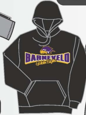
HOODY BLACK or GREY ADULT S-XXL YOUTH M-L $30 PRINTED