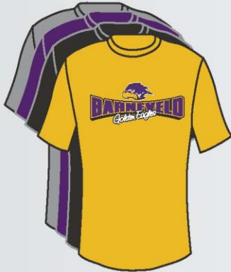
T-SHIRT BLK, GRY, PRP, GOLD ADULT S-XXL YOUTH M-L $10 PRINTED