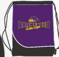
SACKPACK PURPLE $15 PRINTED