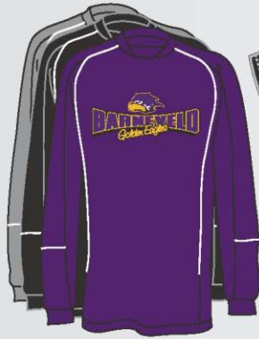
LONG SLEEVE PERF. SHIRT BLK, PRP, GRY S-XXXL $33 PRINTED