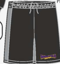
POCKETED SHORTS BLACK or GREY S-XXL $20 PRINTED