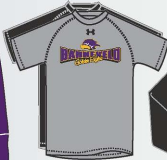
PERFORMANCE T GREY or BLK YOUTH M-L ADULT S-XXXL $20 PRINTED